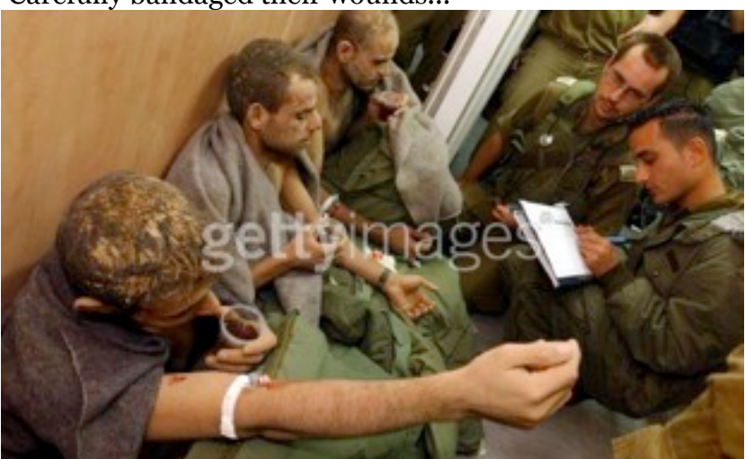
Gave them tea...