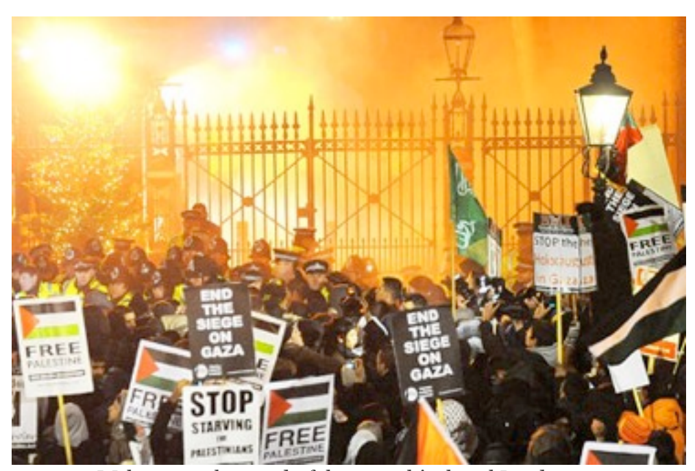
Welcome to the wonderful new multicultural London.