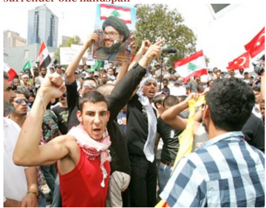
Support for Hizballah's jihad, even in Oz

Pro-jihad demo in Oz: "Palestine is Muslim land, Muslims will never surrender one handspan"