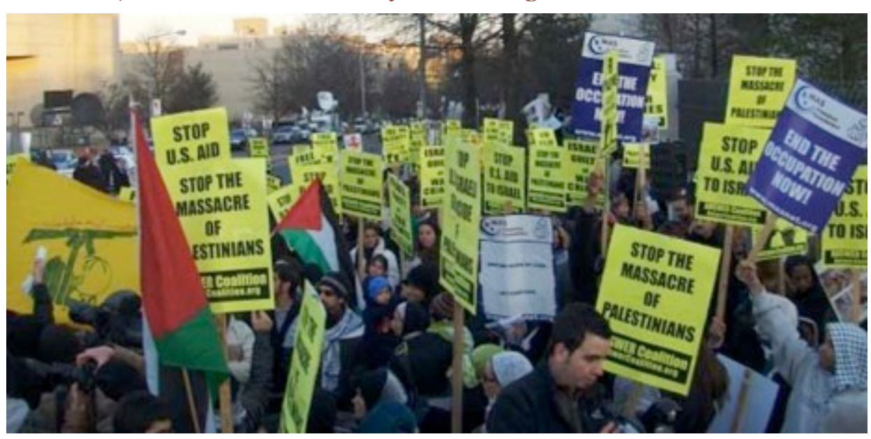
Hizballah flag at left