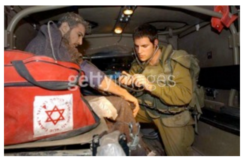
Carefully bandaged their wounds...