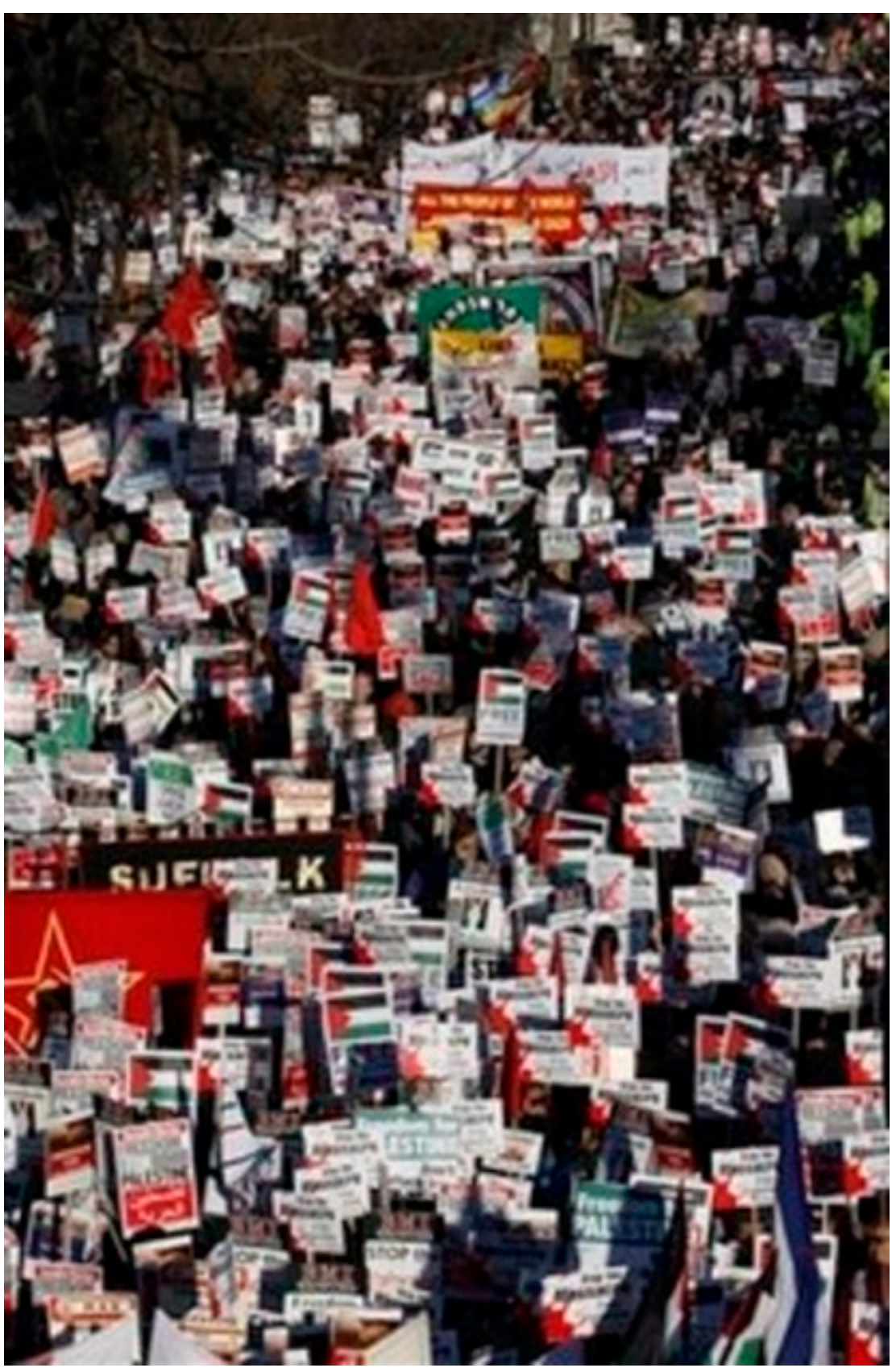
The commonality of despising the Jews