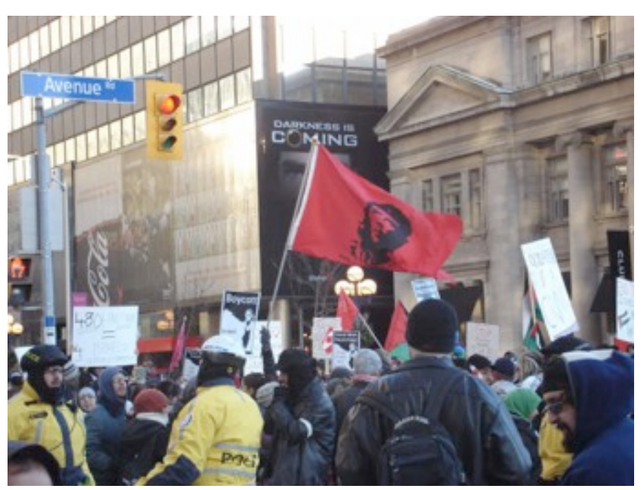
"Darkness is coming": ain't it the truth