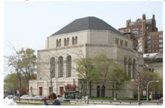
Yes, it can happen here

Chicago: Molotov cocktail thrown at synagogue