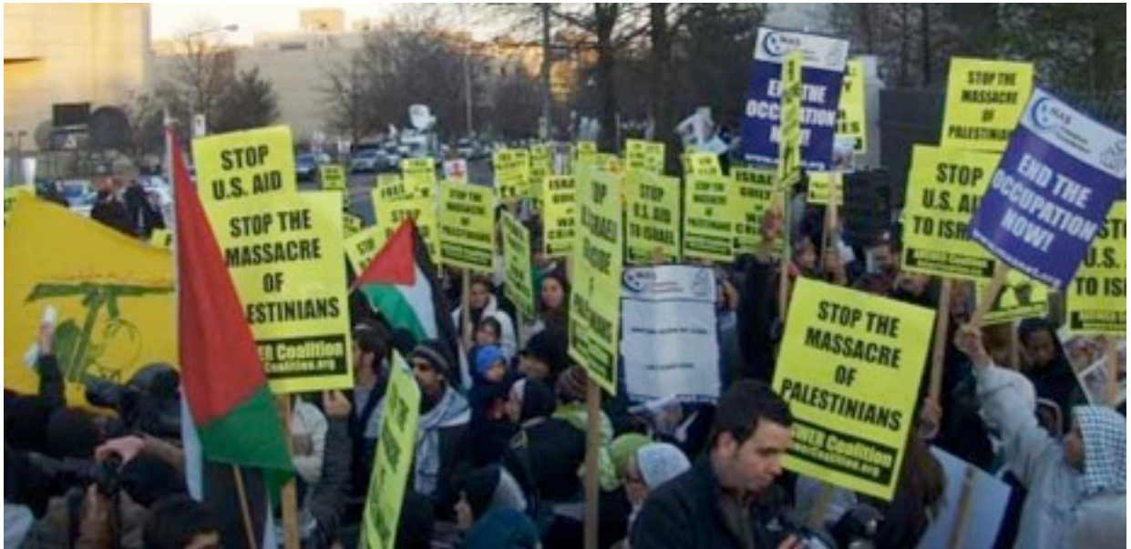
Hizballah flag at left