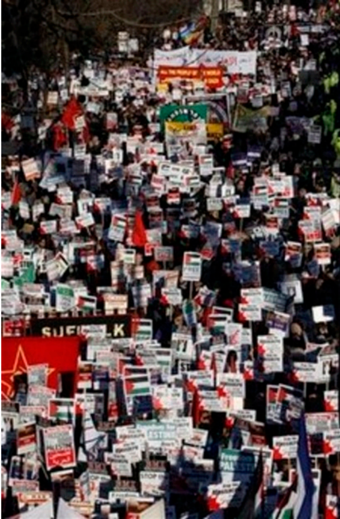
The commonality of despising the Jews