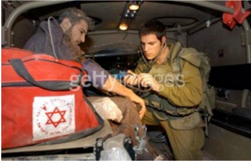
Carefully bandaged their wounds...