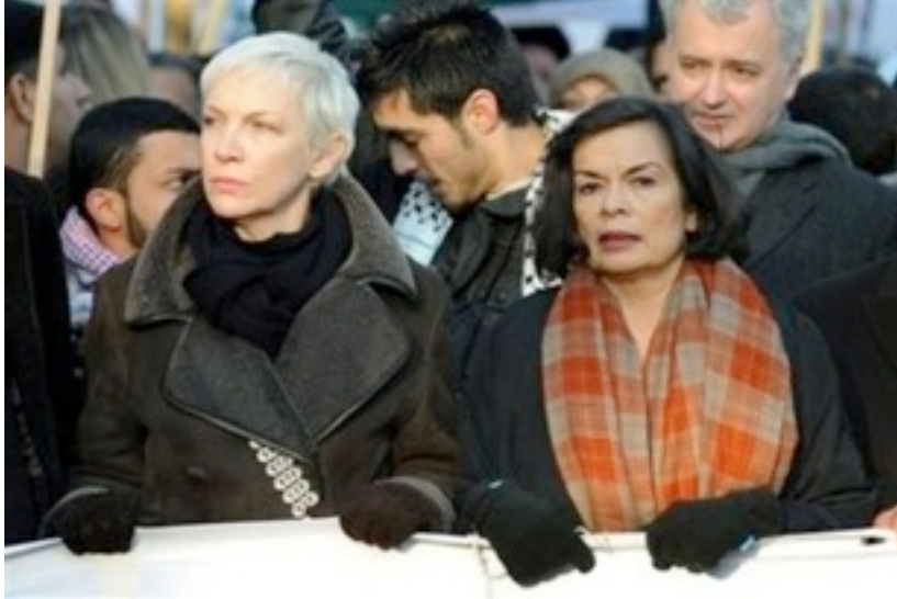
Singer Annie Lennox and former groupie Bianca Jagger march along Whitehall, London, amidst a crowd of thousands to demonstrate against the Jews.