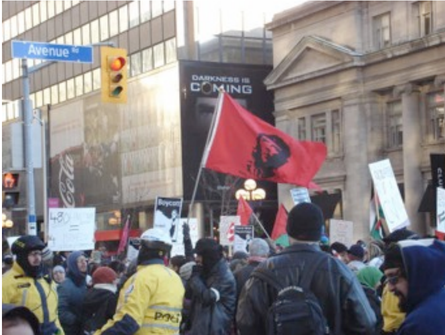
"Darkness is coming": ain't it the truth