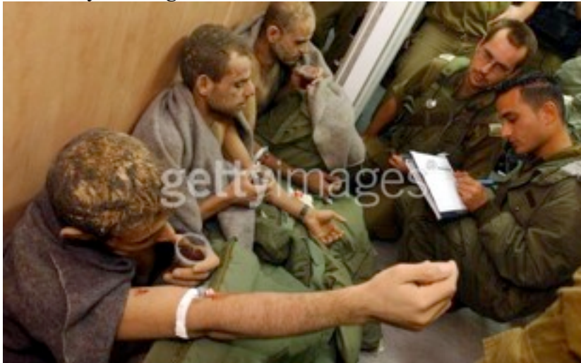
Gave them tea...