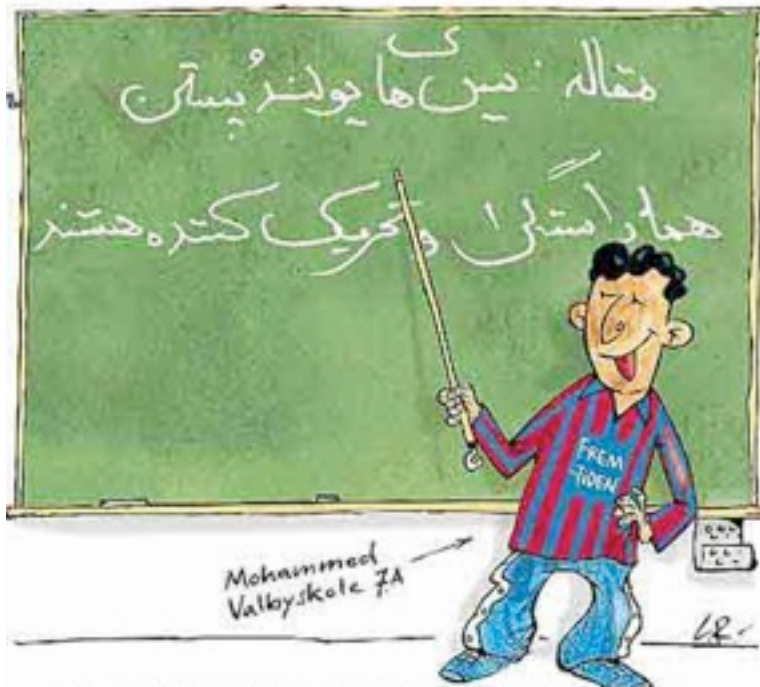
On the blackboard it says in Persian with Arabic letters that "Jyllands-Posten's journalists are a bunch of reactionary provocateurs"