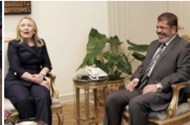
Sec. of State Clinton & Egyptian President elect Morsi