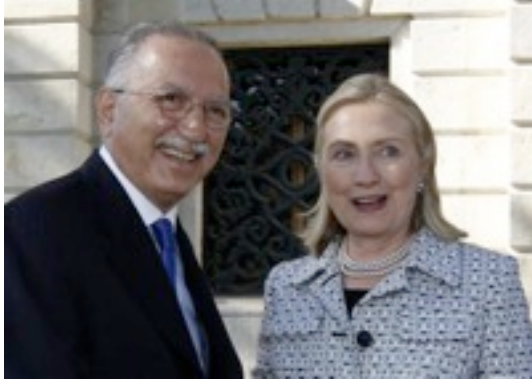
OIC Gen. Sec. Ekmeleddin Ihsanoglu & Secretary of State Clinton in 2011. Working to restrict truth telling about Islam.