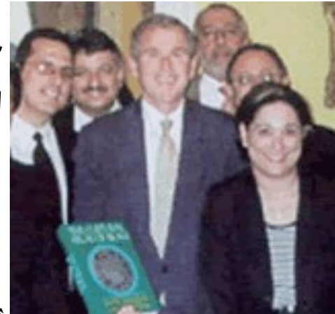
Alamoudi behind George Bush