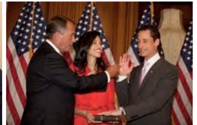
With Husband Senator Schumer Senator Boehner and Husband Senator Schumer