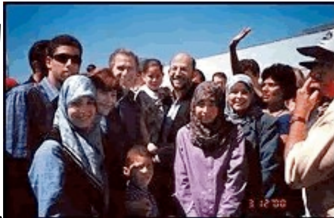
George & Laura Bush & Sami Al-arian