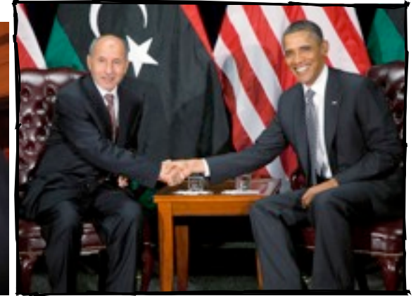
Obama meets Libya's Mustafa Abdul Jalil praises Libya's turn toward Sharia 2011 Muslim Brotherhood leads government 2012