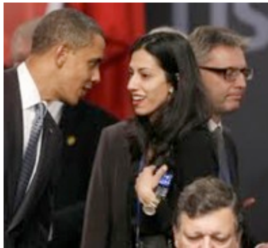
With President Obama