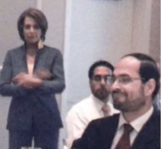
Pelosi holds fundraiser w/ Nihad Awad & CAIR