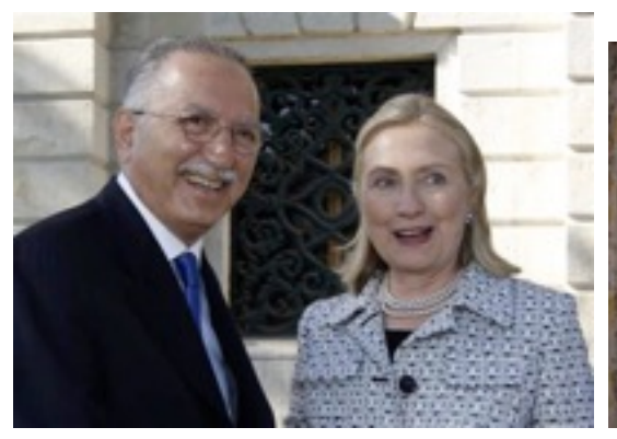
OIC Gen. Sec. Ekmeleddin Ihsanoglu & Secretary of State Clinton in 2011. Working to <u>restrict truth telling</u> about Islam.