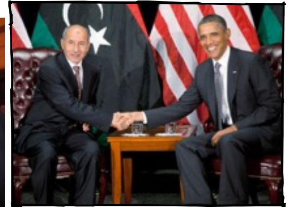
Obama meets Libya's Mustafa Abdul Jalil praises Libya's turn toward Sharia 2011 Muslim Brotherhood leads government 2012