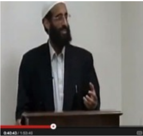
Imam al-Awlaki leads prayer on Capitol Hill Killed by US drone missile in Yemen