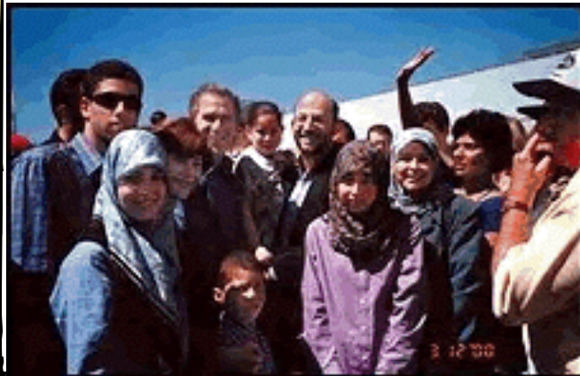
George & Laura Bush & Sami Al-arian