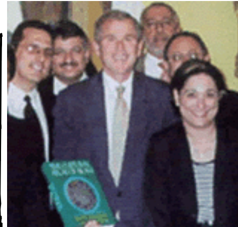
Alamoudi behind George Bush