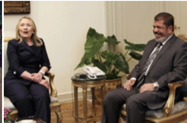
Sec. of State Clinton & Egyptian President elect Morsi