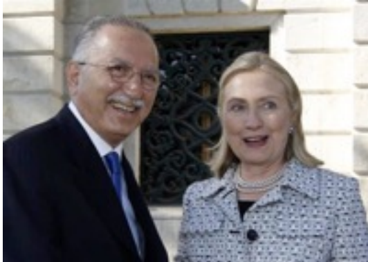
OIC Gen. Sec. Ekmeleddin Ihsanoglu & Secretary of State Clinton in 2011. Working to restrict truth telling about Islam.