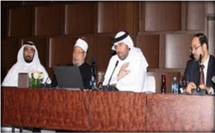
Nihad Awad and the genocidal Sheik Qaradawi