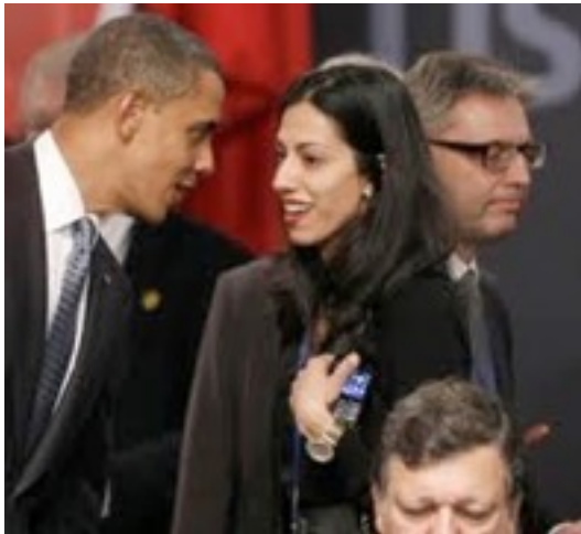
With President Obama