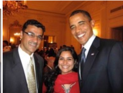
MPAC founder Salam al-Marayati