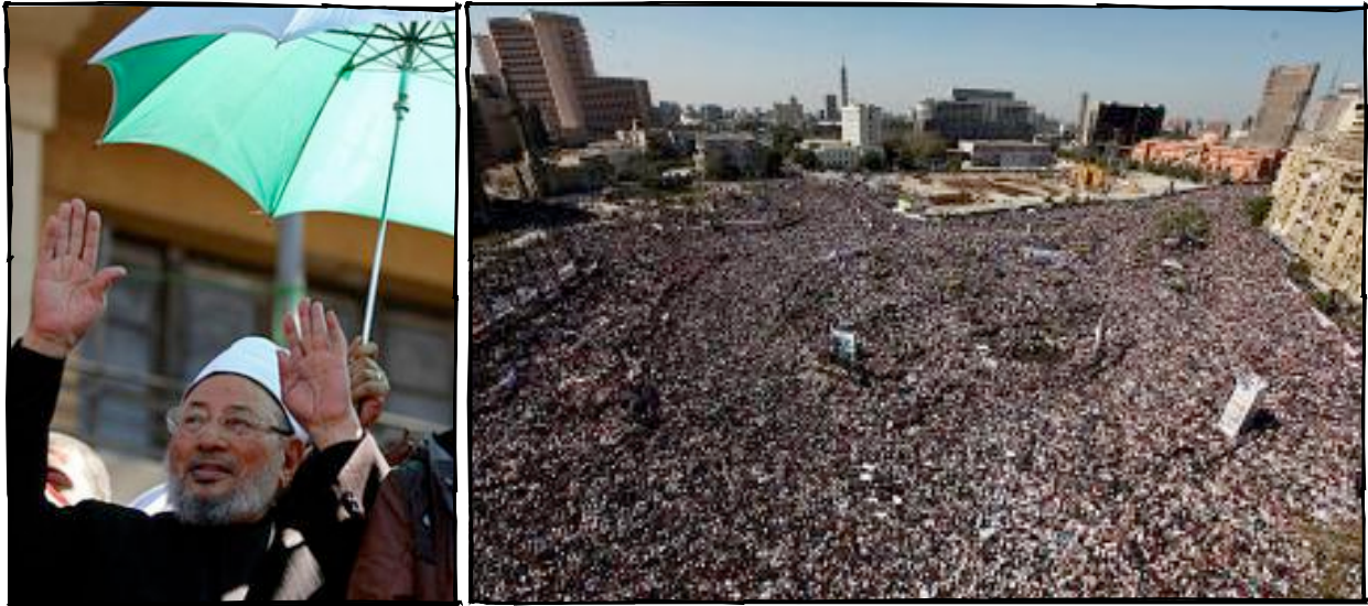
Professor Esposito: Mainstream Reformer™. Carnegie Scholar™ Noah Feldman: Islamist democrat™ Drew biggest crowd of the Egyptian Arab Spring™ 2011 after being banned for 30 years.